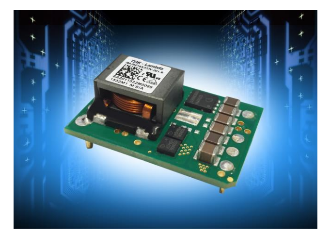
i6A DC-DC Converter

Recently, non-isolated DC-DC converters like TDK-Lambda's i6A series have been launched, targeting the industrial market. Featuring wide-range input voltages of 9V to 40V, the converters are capable of being adjusted from 3.3V to 24V. Up to 250W or 20A outputs can be delivered.